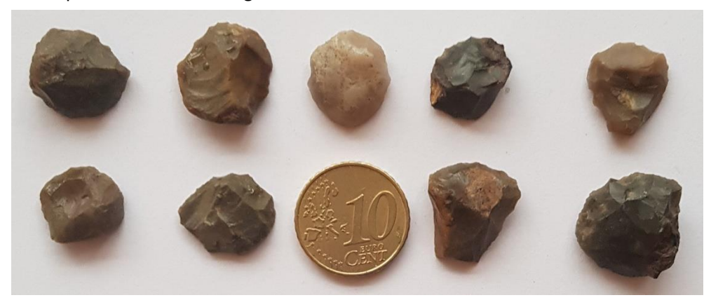
Figure 15 Button-scrapers

Looking at the characteristics of the individual artefacts a Mesolithic context is most likely. Looking at the composition of the total "toolkit" the finds are most likely the result of an activity during a hunting or gathering trip. The butchering of captured animals en more in particular the cleaning of hides come to mind.