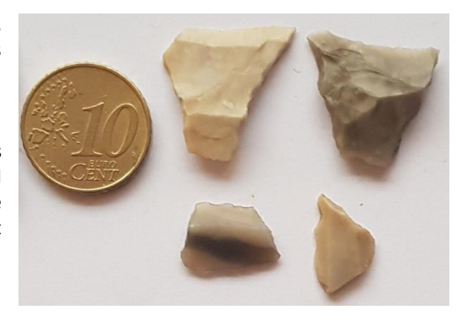
Figure 17 Mesolithic points

The Mesolithic points are all isolated finds, mostly transversal points. (These points were inserted as barbs in the shafts and fixed with tree raisin and sinew, fig. 16) One can imagine that looking in the dense vegetation for a an arrow that missed the target is somewhat like looking for the proverbial "needle in het haystack". Pursuing the animal in order to get of a second shot seems to be a better use of your time.