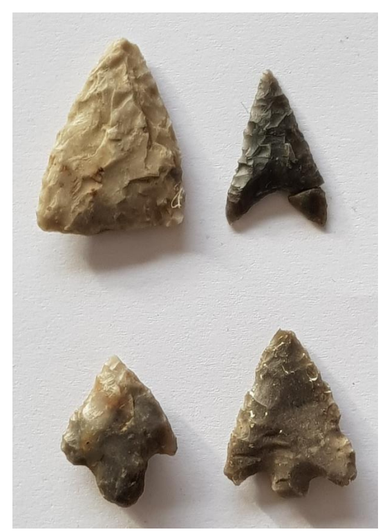
Figure 14 Neolithic arrowheads with surface retouch