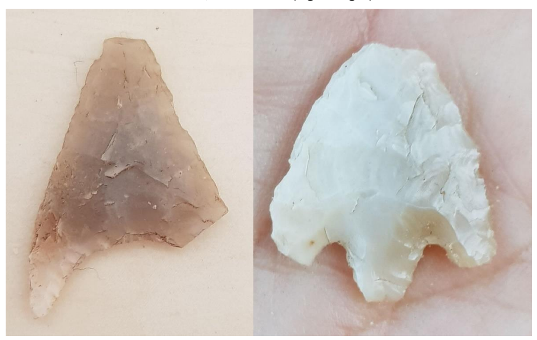
Figure 18 Neolithic arrowheads

Recently we found a second Neolithic arrowhead, with 3 barbs (Fig. 18 right)