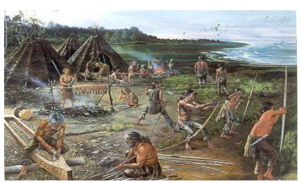
Figure 10 Mesolithic seasonal camp