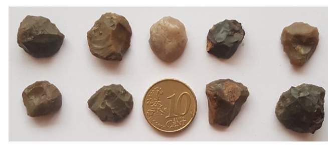
Figure 7 Some button scrapers Figure 8 One Paleolithic, 4 Mesolithic en 2 Neolithic points

In the whole area we have found approx. 25 scrapers, most in one location only a few meters square. Further 4 Mesolithic points two Neolithic points and possibly a (part of) Paleolithic point. As far as waste products are concerned: two cores, 2 small blades en a few dozen flakes.