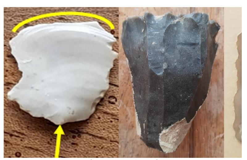
Figure 3 Artefactsn en pseudo-artefacts Flake with percussion bulb and -ripples Core (Broken) Blade Nodules and "Pot lids"

percussion (see the clear waves just inside the yellow arc). The stone from which the flakes were detaches is called a core. (Fig 3 middle left) A good flintknapper can produce long small flakes that are named blades. (Fig 3 middle right) Blades are processed into arrowheads, (razor-sharp) knives, scrapers and drills (to process hides, bone antler and wood) and everything else they needed.