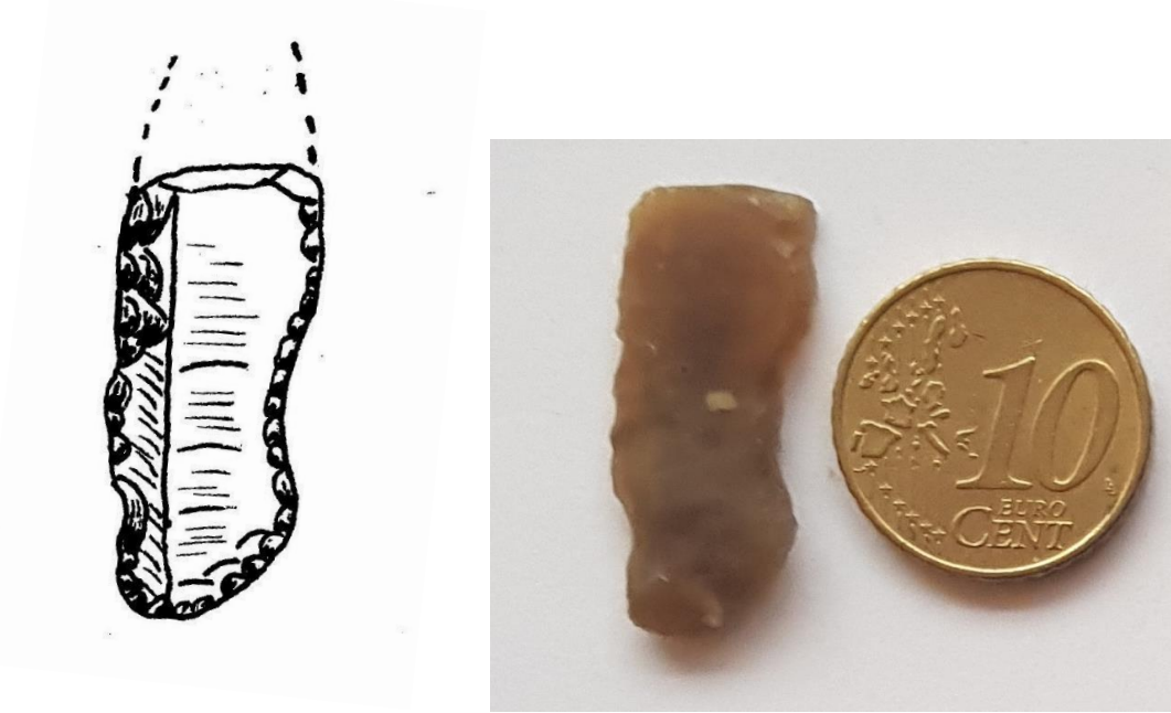
Figuur 19 (Part of a) Kremser-point

The possible young-Paleolithic arrowhead is a real tidal case. It would be very nice if 10.000 years ago a reindeer hunter roamed the area "De Zanding" and left an artefact there. (Fig 19)