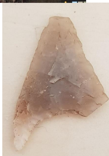
Figure 2 Neolithic arrowheads

Most common artifacts are flakes. Flakes are generally thin flat pieces of flint that are either a semi-finished product or waste produced while making a tool. A trained eye can see the location where the maker hit the original block of flint when he detached the flake, the bulb of percussion. (The yellow arrow in fig. 3 left). A second hallmark are the ripples, concentric waves radiating from the point of