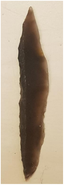
Figure 12 Tjonger-point, The left side is retouched