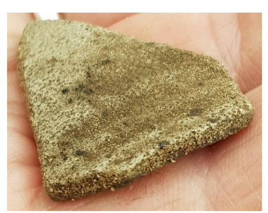
Figure 20Stoneware sherds

It seems that from the bronze age onwards this area was not visit frequently, at least not with activities resulting in the interment of artefacts from the bronze age, iron age or early middle ages.