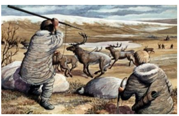
Figure 9 Paleolithic reindeer hunters

In the Neolithic flint was traded over vast distances. In Rijckholt-St Geertruid in Southern-Limburg many flintmines were found. We also find flint artefacts in Holland that were made in France and in Denmark.