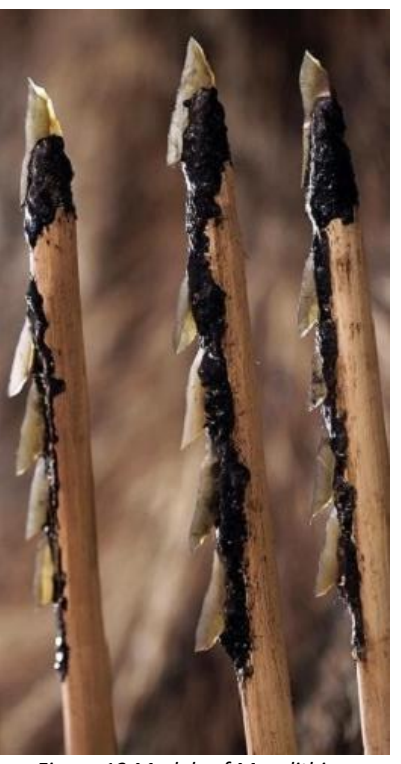
Figure 13 Models of Mesolithic arrows